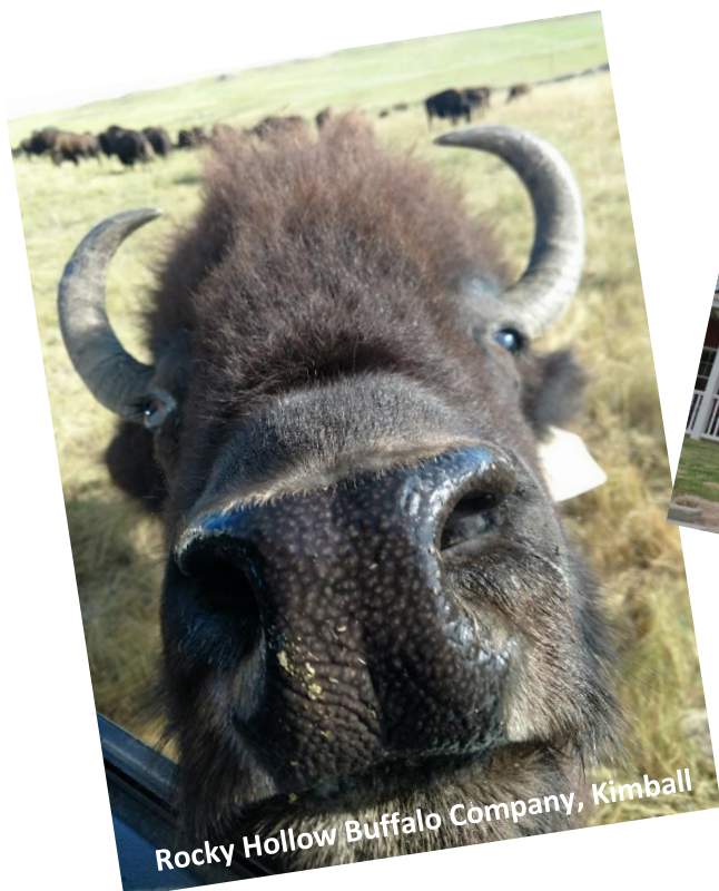
Rocky Hollow Buffalo Company, Kimball